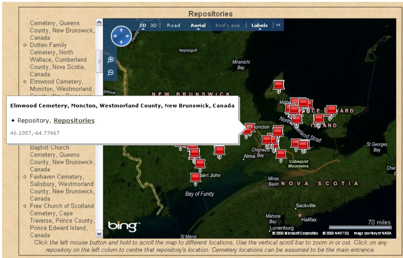
View of Microsoft Virtual Earth map, Elmwood Cemetery selected.