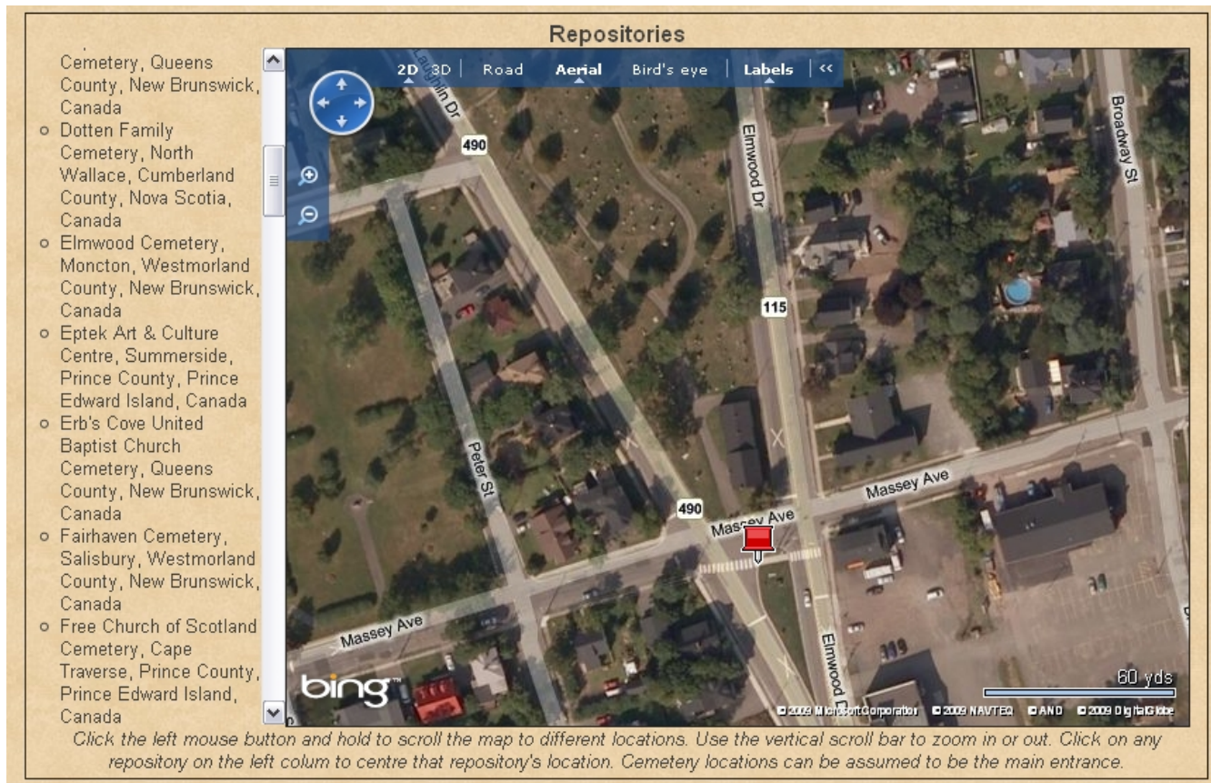
View of the main entrance of Elmwood Cemetery when zoomed in.