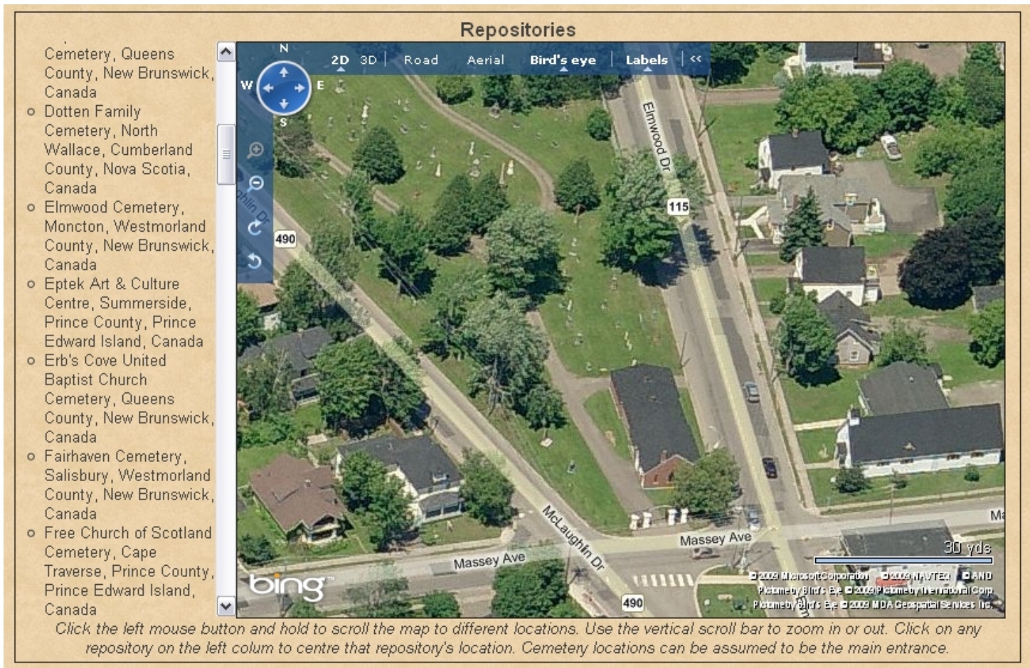
View of the main entrance of Elmwood Cemetery, Bird's Eye View.